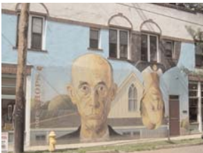
A mural in Columbus, Ohio's Short North district riffs Grant Wood's American Gothic.

Columbus wraps some of its best treasures right near the heart of downtown. A few blocks from the city core, German Village hums with activity. Built in the 1860s by German immigrants, the trendy neighborhood is one of the nation's oldest historic districts. The sturdy brick streets are lined with