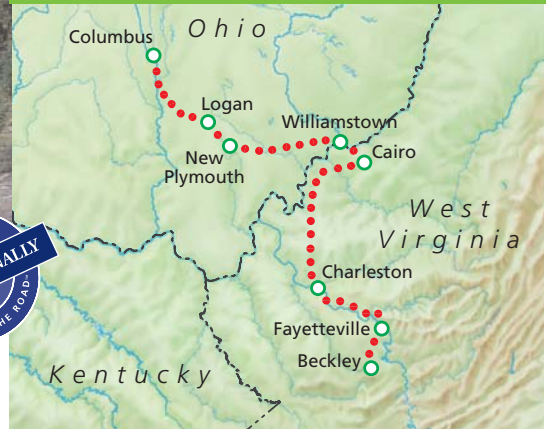
For full maps of Ohio and West Virginia, see pp. 78-81 and 112 of the Rand McNally 2006 Road Atlas.