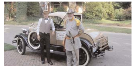
Homeowners in period dress pose in Parkersburg, WV.

Across the Ohio River, Parkersburg, West Virginia, wears its age well. At the Visitors Center, detailed brochures are available for a tour of the Julia-Ann Square Historic District. Though the 26-home tour is designated as walk-by, the proud homeowners sometimes invite curious passersby in for a peek into the renovations.