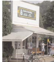
Riders can rent bikes in Cairo, WV for a rail trail trip through old train tunnels.

Half an hour east of Parkersburg in Cairo, just off US 50, the 72-mile North Bend Rail Trail includes thirteen tunnels for bikers to pass through, including one purported to be haunted. Country Trails Bikes , just off